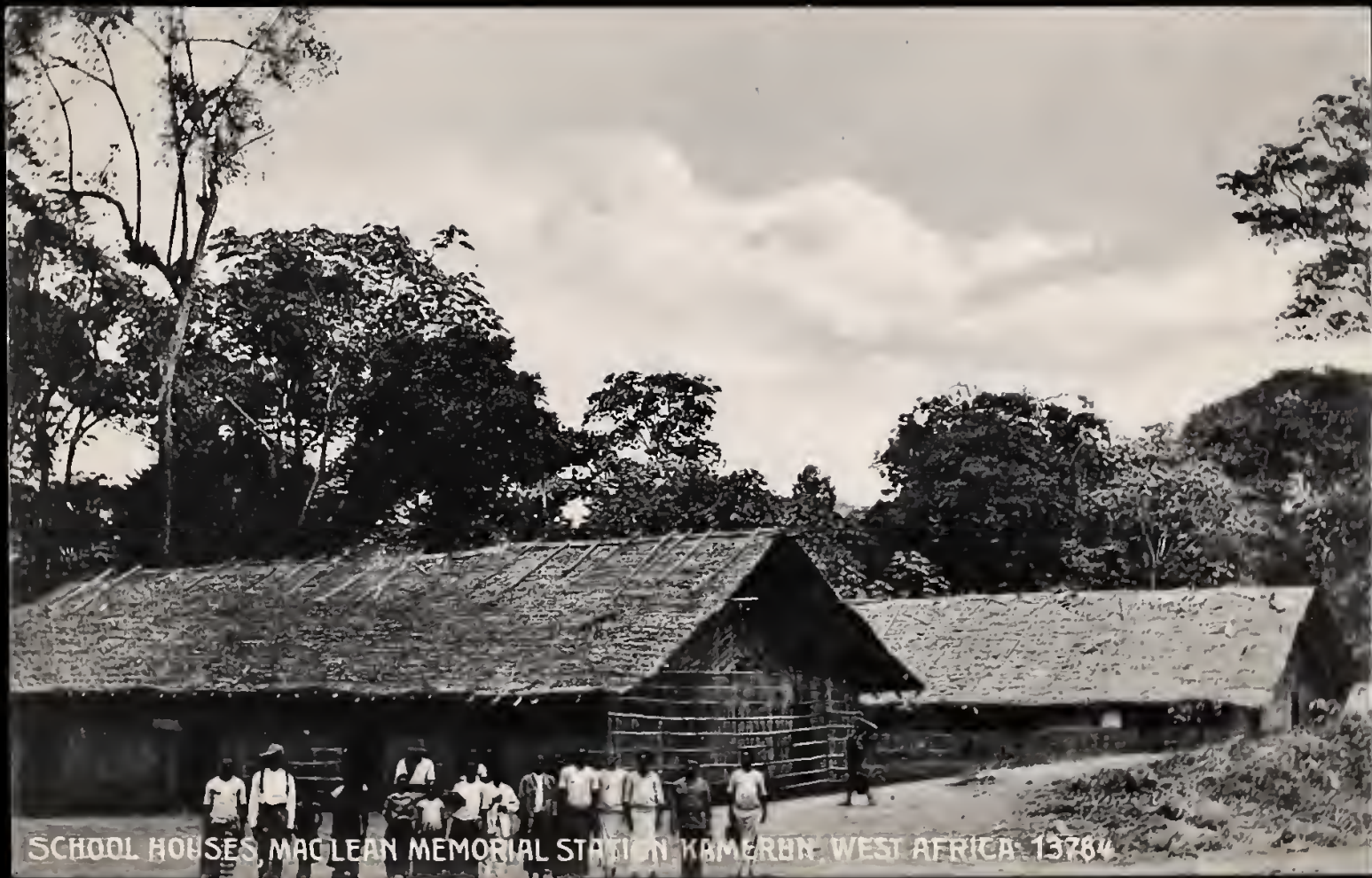
SCHOOL HOUSES, MACLEAN MEMORIAL STATION, KAMERUN, WEST AFRICA, 1934